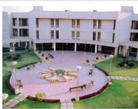
NIESBUD programme for skill development

New Delhi: The National Institute of Entrepreneurship and Small Business Development (NIESBUD), a premier Institute under the Ministry of MSME has decided to launch a major project for entrepreneurship and skill development of youth in the country.